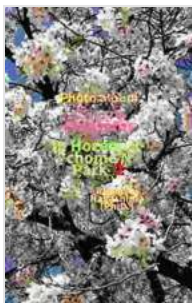
Photo album Cherry Blossoms in Hozenji 3-chome N Park 2

firsthand. If you have the opportunity to visit Hozenji Chome Park during cherry blossom season, do not miss the chance to immerse yourself in its enchanting atmosphere and create lasting memories of this unforgettable spectacle.