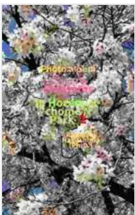
Photo album Cherry Blossoms in Hozenji 3-chome N

For photographers, Hozenji Chome Park is a dream come true. The park's unique design, with its narrow, stone-paved paths lined with towering cherry trees, creates a picturesque setting that lends itself to stunning compositions. The abundance of blossoms, swaying gracefully in the breeze, offers endless opportunities for capturing the essence of this fleeting beauty.