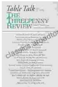
Table Talk: From the Threepenny Review by Jennifer Zahrt

Prepare your palate for a literary feast as you delve into "Table Talk From The Threepenny Review," a captivating collection of conversations that will tantalize your mind and leave you yearning for more.